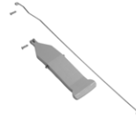
Pedal set for Magic bag holder